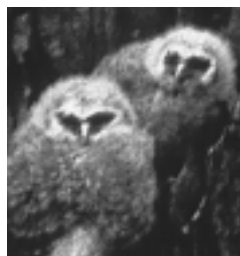
Northern spotted owlets